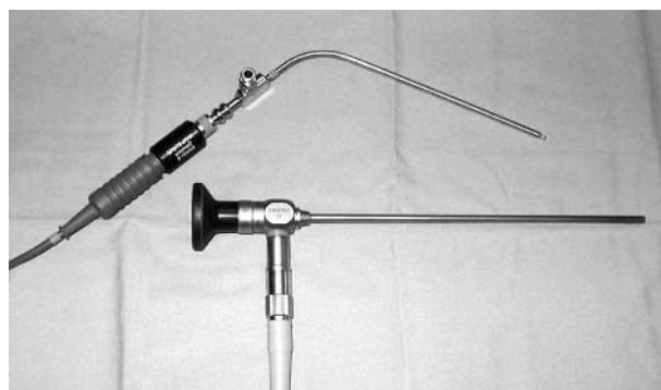
Figure 4 Endoscopic electrocautery equipment.

Over the past 10 years, there has been a significant expansion in the options available for the management of epistaxis. Traditional strategies like nasal packing have been supplemented by modern technology using the latest optic and electrical devices. Treatment should ideally use a systematic protocol, such as described in this review; starting with simple procedures that can be undertaken in the clinic environment and proceeding to endoscopic techniques for more difficult cases.